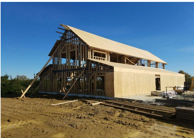
Dragoon Trace Nature Center taking shape